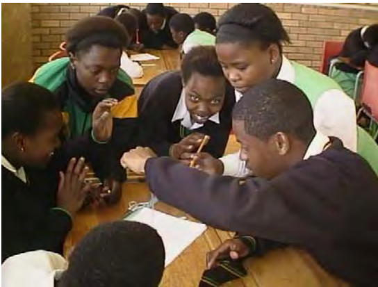
Strips are charged, learners look fascinated.