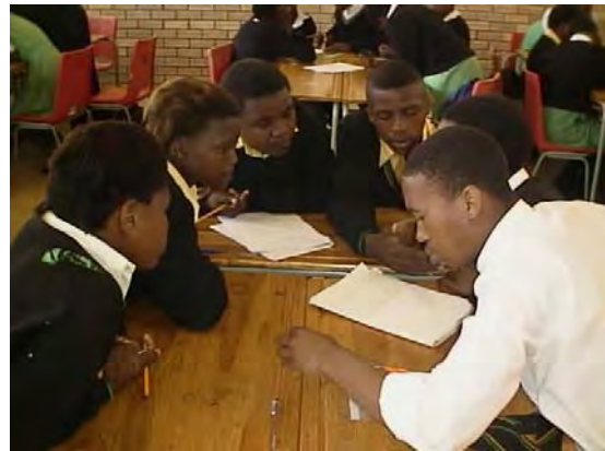
Learners discuss to make sense of concepts.