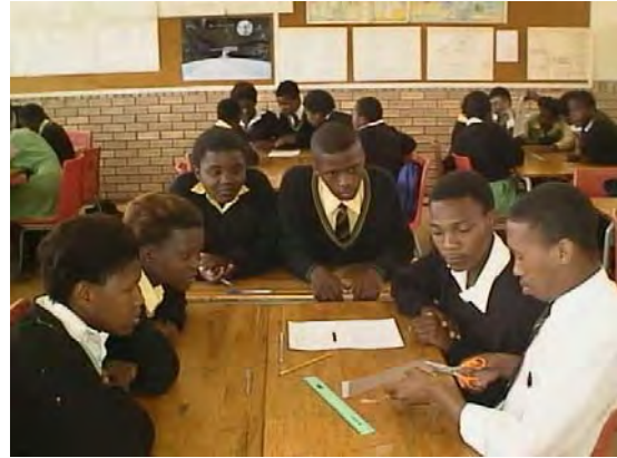
Learners actively involved in hands-on and minds-on practical activities.