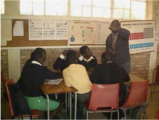
Teacher scaffolding showing learners how to rub strips to get them charged.

Below are pictures showing learner minds-on and hands-on interactions.