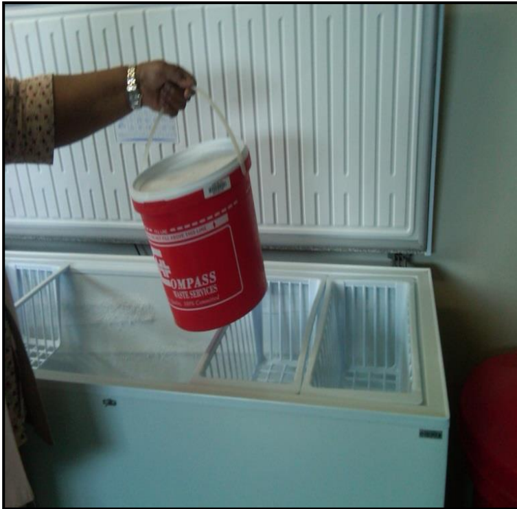
Figure 6.11: Nompumelelo Hospital: anatomical waste stored in fridges in the mortuary (Maseko, 2012)