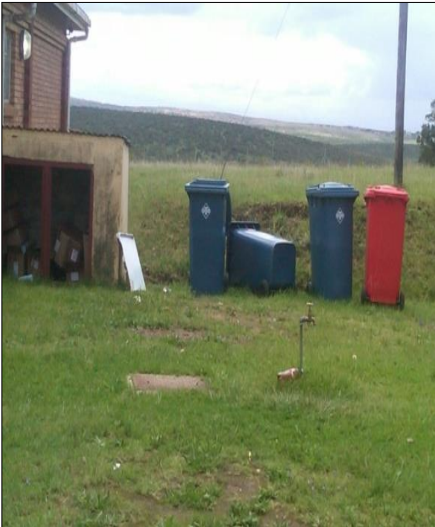
Figure 6.6: Medical waste awaiting collection at Nompumelelo Hospital (Maseko, 2012)

This shows ignorance, poor training and knowledge on one of the main practices of medical waste management. After the waste is collected and stored in the sluice room, when the large trolley bins are full, they are kept outside until collected (see Figure 6.6).