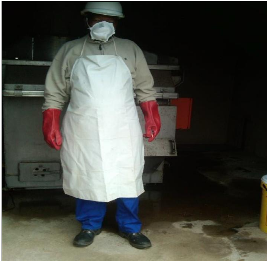
Figure 6.4: Protective clothing for handling medical waste at Nompumelelo Hospital (Maseko, 2012)

While the management at Nompumelelo Hospital seemed satisfied with the way in which waste was being handled, the cleaners had a different take on the matter. The cleaners at Nompumelelo Hospital were not at ease about their working conditions especially the lack of adequate protective clothing whilst dealing with high-risk waste, and one respondent noted: