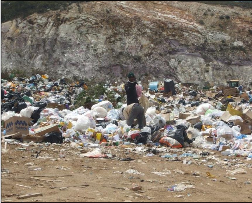
Figure 6.14: Waste reclaimers at the Makana Municipality landfill (Maseko, 2010)