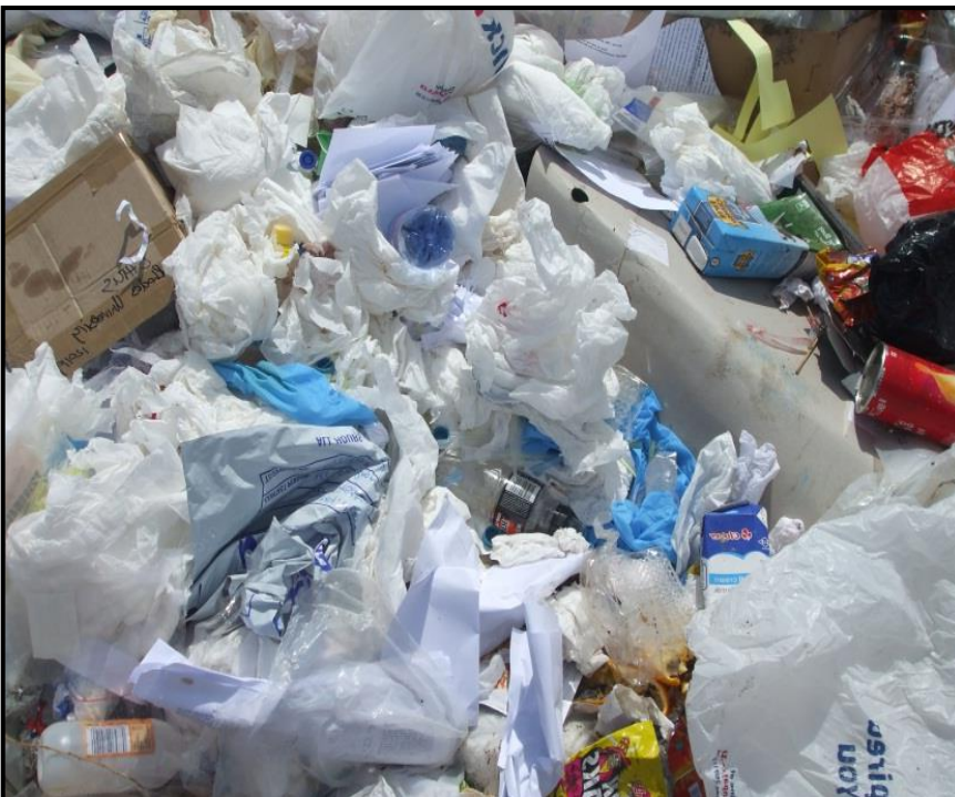
Figure 6.15: General waste mixed with medical waste at one of the Grahamstown landfills (Maseko, 2010)