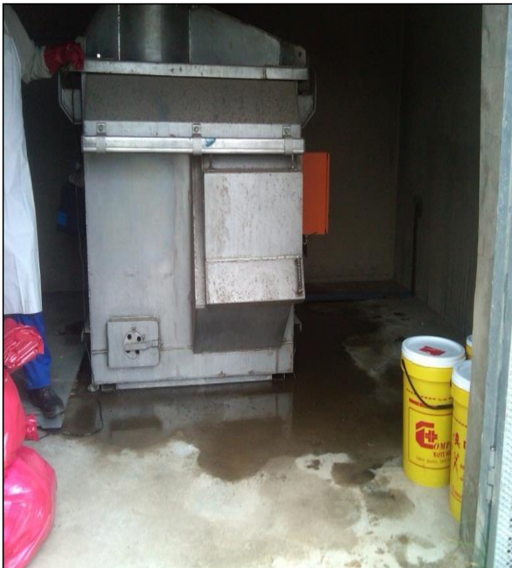
Figure 6.10: Nompumelelo Hospital: old incineration site used as central storage area (Maseko, 2012)

This storage point is not built to store medical waste and therefore lacks all the necessary components such as a fan and fridge to store anatomical waste. It is also not well ventilated and has a deteriorating roof (see Figure 6.10). This structure is old and the fencing around this storage unit is not well secured. The hospital does not appear to have any personnel guarding this storage unit at all times, which means that trespassers could easily gain access. The deteriorating roof means that this area is susceptible to leaks, especially during the rainy season. During this study, the Eastern Cape had been experiencing heavy rains and floods. It was clear during the on-site visit that the roof was leaking as there were wet blotches and stagnant water inside the storage unit. These conditions are not good for the storage of hazardous and infectious waste. It is not a suitable area to store untreated medical waste especially because the waste is stored for weeks on end. Anatomical waste, on the other hand, is stored in the small fridges in the mortuary because of inadequate storage space in an appropriate infrastructure (see Figures 6.11 and 6.12).