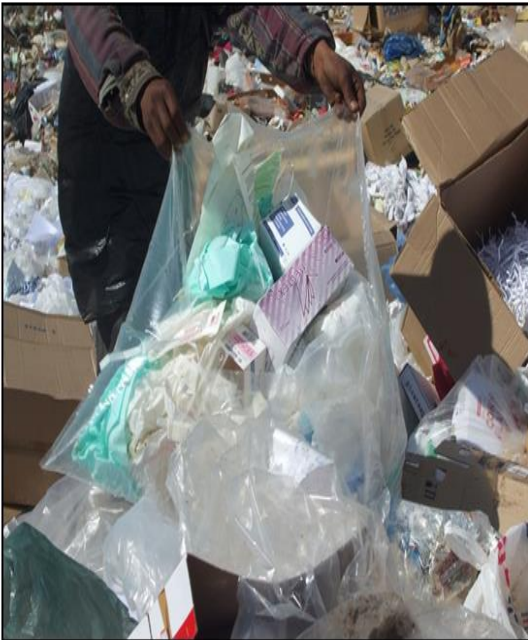
Figure 6.13: A waste reclaimer scavenging through medical waste in one of the Grahamstown landfills (Maseko, 2010)

permitted to dispose of any of their hazardous or infectious waste in any of the landfills. However there have been cases captured in a previous study, whereby recycler workers and reclaimers have come across medical waste that had been disposed of in one of the landfills (Maseko, 2010) (see Figures 6.13, 6.14 and 6.15).