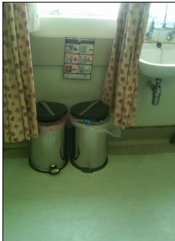
Figure 6.3: Infectious waste containers at Nompumelelo Hospital (Maseko, 2012)