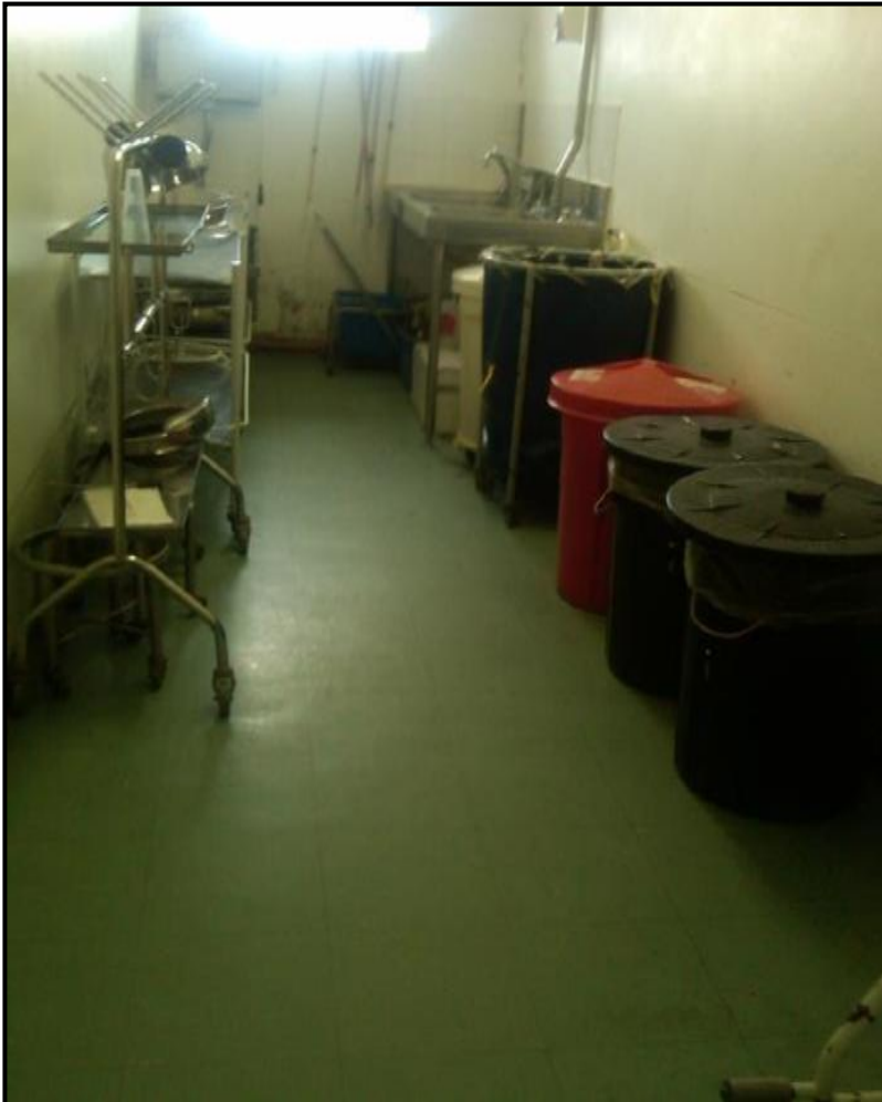
Figure 6.5: Nompumelelo Hospital sluice room (Maseko, 2012)

there are three big bins in the sluice room, one for infectious waste which is put in red bags and other for the yellow bags, then transparent bags and black bags are used interchangeably for general waste and we take from the wards and store it in there. (General Assistant A, Interview with author, 2012)