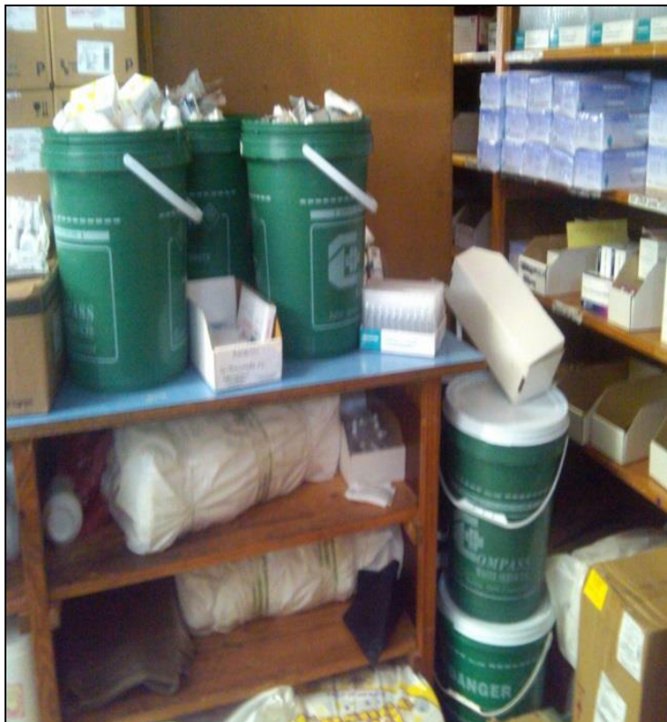
Figure 6.8: Nompumelelo Hospital: storage of pharmaceutical waste (Maseko, 2012)

All pharmaceutical waste was collected by the pharmacists themselves and stored at the pharmacy department. The pharmacy department lacked a storage area to store this waste and as a result the waste was stored haphazardly wherever there was space (see Figure 6.8).