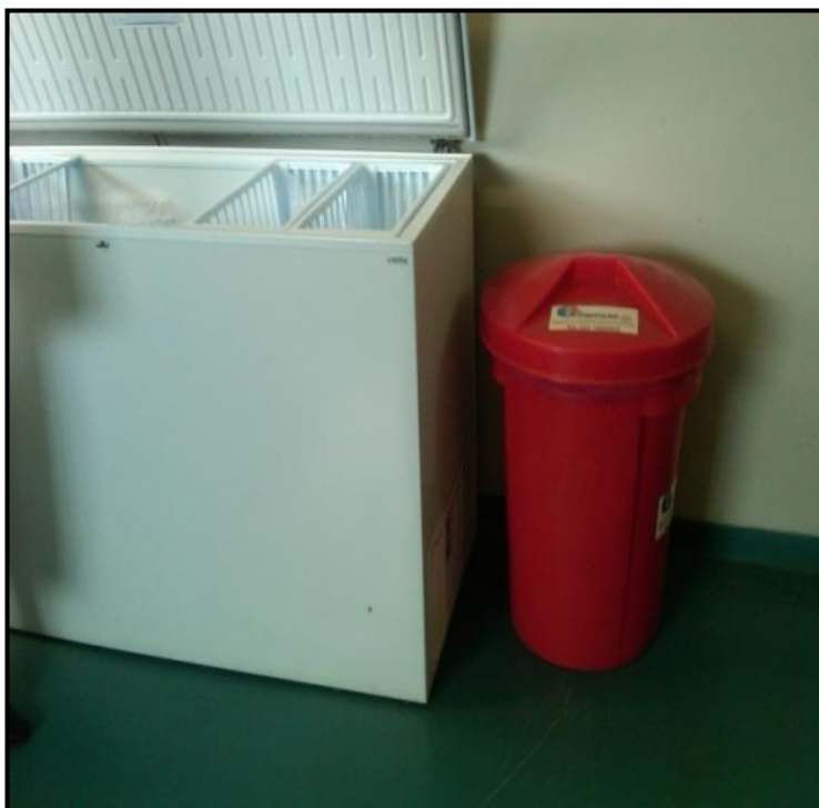
Figure 6.12: Nompumelelo Hospital: the fridge where anatomical waste is stored (Maseko, 2012)