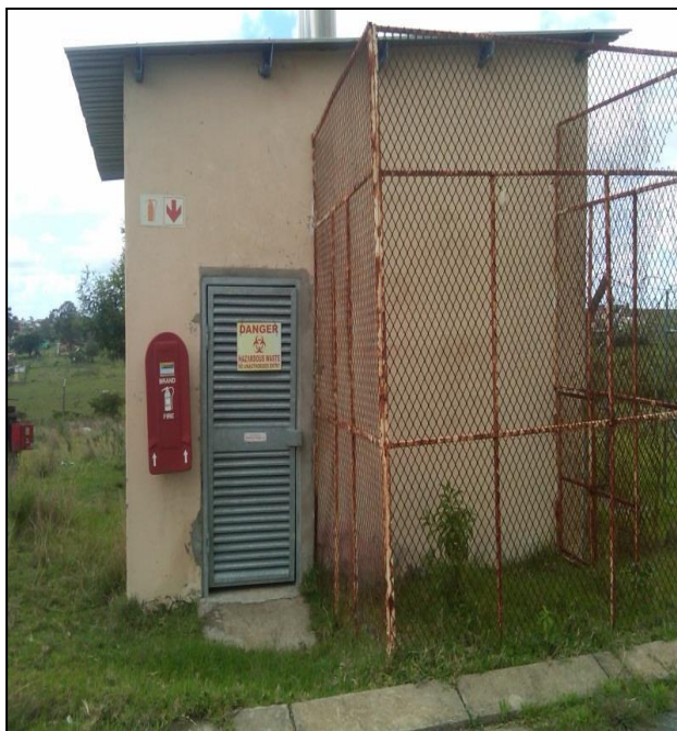
Figure 6.9: Nompumelelo Hospital: old incineration site used as a central storage area (Maseko, 2012)

All waste types from infectious waste and sharps to food waste and general waste at Nompumelelo Hospital are collected and stored in one centralised area which is an old building where the no longer functioning incinerator is situated which is now used as a centralised storage area (see Figure 6.9).