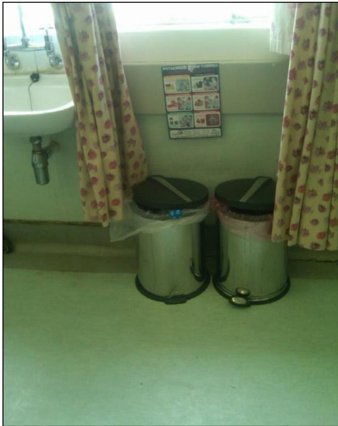
Figure 6.1: Medical waste segregation at Nompumelelo Hospital (Maseko, 2012)

In order to maintain a clean and healthy working environment, it is critical that medical waste is segregated appropriately. Hospitals in the Third World are said to generate significantly higher volumes of waste than hospitals in developed countries (NHCMP, 2003: 4). The problem lies in the failure to classify the waste at the point of generation, which results in an increased amount of waste classified as infectious medical waste that requires special handling and disposal. Proper segregation of medical waste ensures the reduction of infectious medical waste that is disposed of. However throughout the study at Nompumelelo and Settlers Hospital it emerged that there was little or no distinction between infectious waste and non-infectious waste. Whilst conducting interviews at Nompumelelo Hospital I noted that the hospital considered a large quantity of the medical waste that they generated as infectious waste, although not all waste that is generated in a hospital is infectious and hazardous and therefore should not be treated as such.