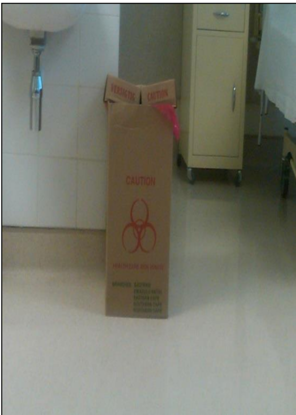
Figure 6.2: Infectious waste containers at Settlers Hospital (Maseko,2012)

No it's the general assistants that collect, then the men from the workshop put it to the storage, then they are divided, the black plastics are taken to the municipality, we use the bins for foetus and limbs which is closed then sealed. (Nurse B, Interview with author, 2012)