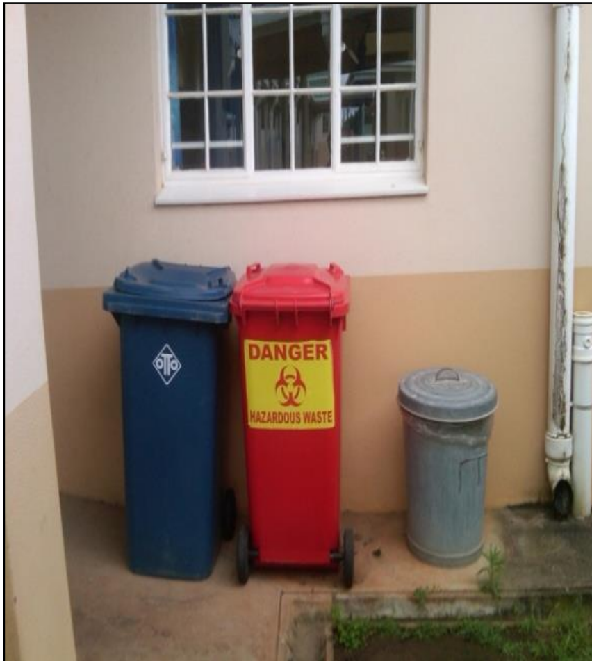
Figure 6.7: Medical waste awaiting collection outside the wards at Nompumelelo Hospital (Maseko, 2012)

WHO (2008:36) requires all medical waste to be stored in an area that is inaccessible to avoid unauthorised personnel from handling infectious waste. Medical waste is meant to be stored away from the wards to avoid interference from passers-by and to avoid public exposure to infectious waste. It was noted that there have been cases where oblivious patients and members of the community have interfered and tampered with medical waste stored outside in the trolley bins at Nompumelelo Hospital. This poses a serious health risk to these people who are not trained to handle medical waste and who are unaware of the risks involved in handling this type of waste. It is unsafe for infectious waste to be stored in an outside area that is easily accessible because reclaimers and patients can easily manipulate and open these bins and expose themselves to health risk. The hospital also had instances of patients in the psychiatric ward taking some of the medical waste and fiddling with the bins when left outside.