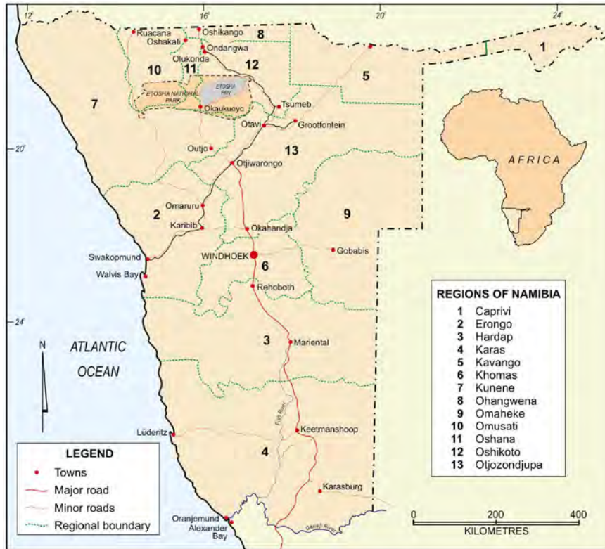
Figure 1. Map of the regions of Namibia

Figure 1. Map of the regions of Namibia, (Sue Abraham. (2006). Graphics Unit, Rhodes University, Grahamstown.)