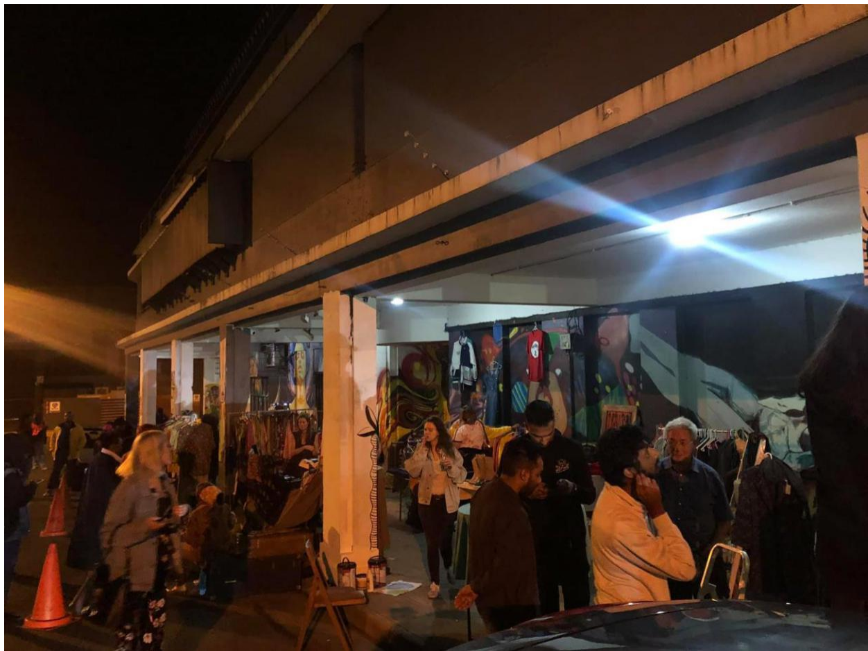
Figure 2: Event location. The Winston Pub, Durban's historic live punk music venue. 09 August 2019.