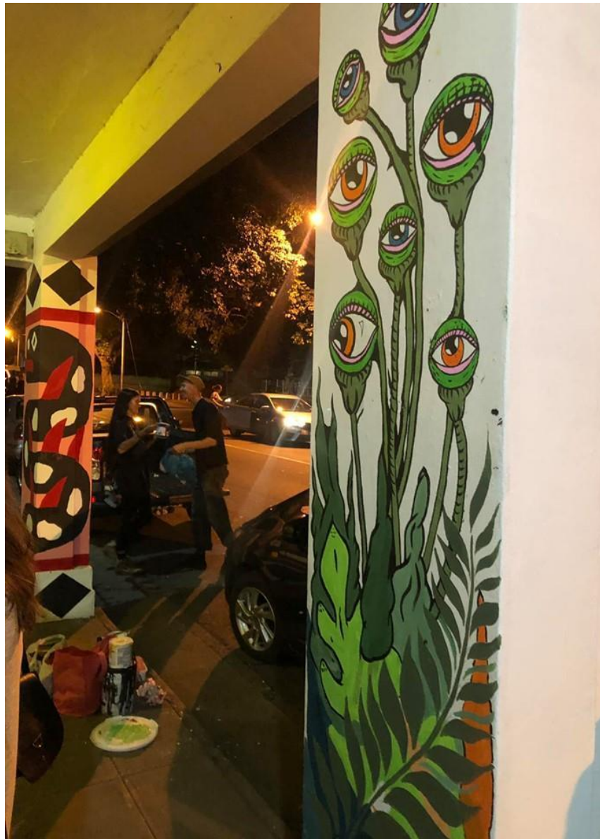
Figure 4: Murals in progress by Diantha Achary (right) and Kylie Wentzel (left). Clark Road, Umbilo, Durban. 09 August 2019.

arenas. A crowd gathered around in a cluster, some people sat down cross-legged on the pavement, others stood out in the street, narrowly escaping the passing cars. Some passers-by stopped for a minute to listen, some stayed, some didn't notice at all. I found the audience to be very supportive and respectful. They listened attentively but also cheered, clapped, jumped in with comments, made requests, and took out their cellphones to make pictures and videos. I enjoyed the informal ease of the interaction with the audience, the gap between us felt small. I think this may have been due to the fact that the space in which we were all in, was undefined, there were no strict codes to adhere to, as there may have been in a book-store, a gallery, or in a seminar room. The space was being made in that moment.