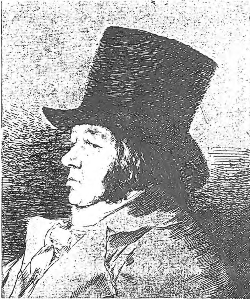
Fran. co Goya y Lucientes, Pintor