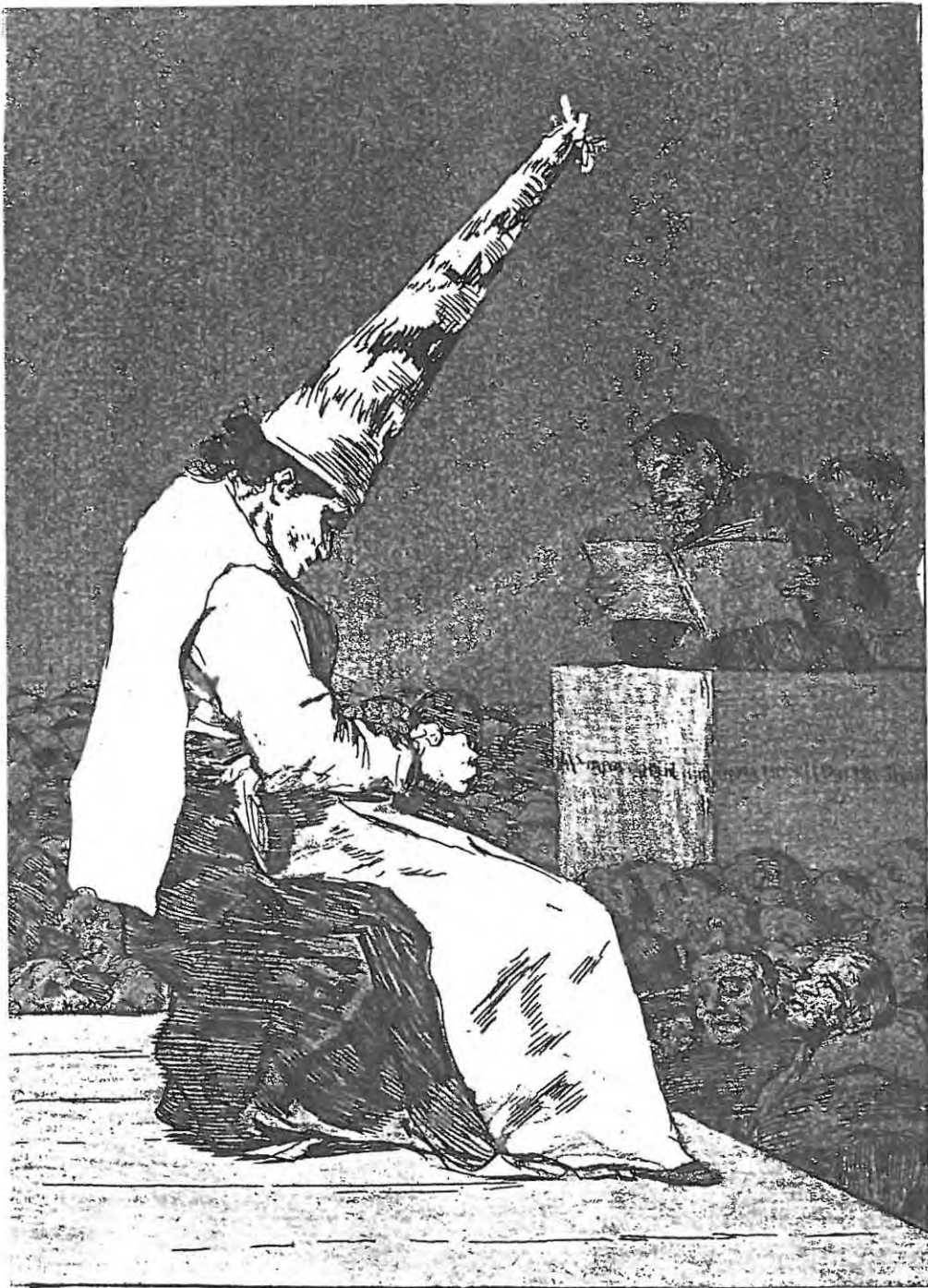
A aquellos polvos