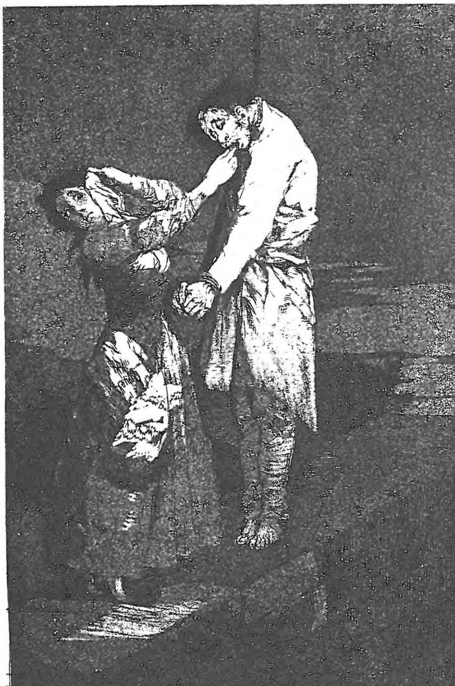
A caza de dientes