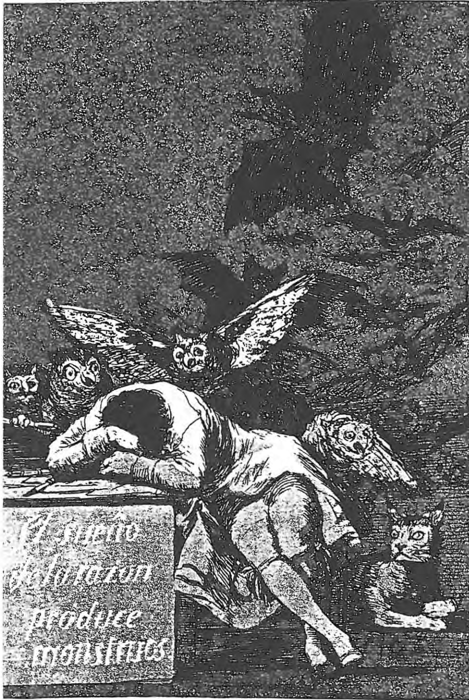
Illus. 2 (The sleep of reason produces monsters)