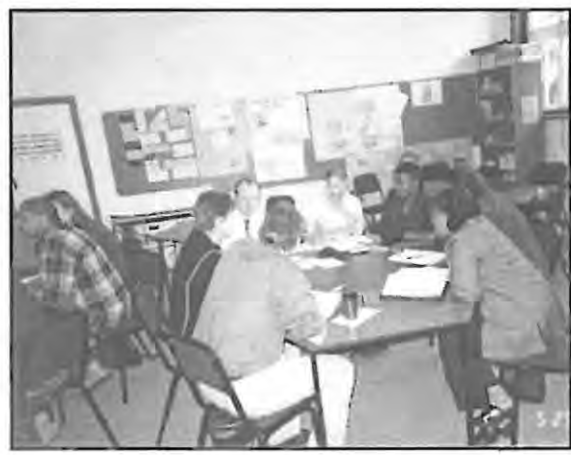
Figure 3: Focus group (Group 2).

The other focus point of the discussion was on the training needs in the Makana Municipality. The generated themes on training needs from the focus group were coded 'focus group training needs' (FG1/TN; FG2/TN). The strength of this method was that I was able to get rich data on descriptions of environmental issues and training needs as people narrated their experiences.