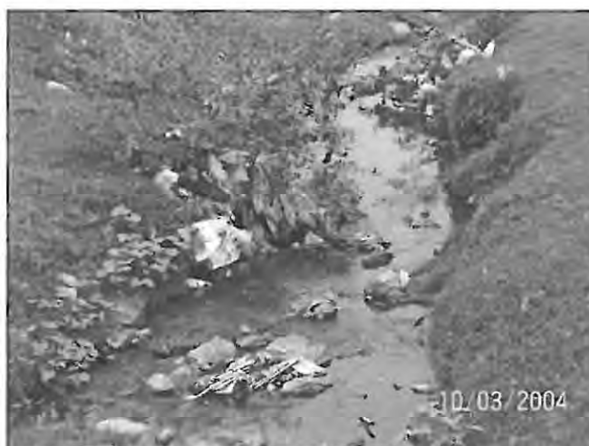
Figure 4: The polluted Kowie River

During the focus group discussions it was established that the buckets were not regularly collected. The focus groups further provided information that on weekends, when families have funerals and social functions, the buckets fill up and get emptied into storm water drains, due to the lack of adequate collection services. This human waste therefore permeates itself in the river systems of Grahamstown. The focus groups also noted that as a result of resentment of the bucket system, people tend to “use the nearby bushes and streets to relieve themselves” (FG1; FG2). Figure 4 shows a typical situation of polluted local rivers in Makana Municipality, which pose a health to hazard to nature and human life.