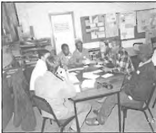
Figure 2: Focus (Group 1).

During the focus group discussion, I took some photographs, which show two different groups involved in the prioritisation of environmental management issues in Makana Municipality. Figure 2 shows focus group 1 and Figure 3 shows focus group 2.