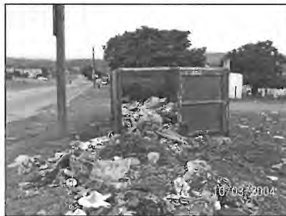
Figure 5: Illegal dumping of solid waste around the skip

skips was compounded by people (waste pickers) who threw worthless refuse out of the skips and caused a mess around the skips. Focus group respondents further noted that “livestock, especially donkeys and goats and animals like dogs, spread rubbish by looking for food in the rubbish bags and skips and spread the litter around” (FG1). Focus group further explained that solid waste management affected almost all skips around Grahamstown, Scott’s Farms and Hoogenoeg areas (FG2). Both focus groups agreed that the most affected areas included Victoria Road and the townships, especially Extension 9. Figure 5 shows a skip in Makana municipality with illegally-dumped waste, which makes it difficult to manage waste.