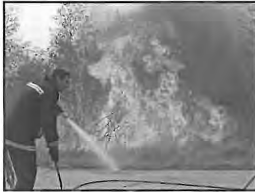
Figure 8: Fire fighter attempting to put out fire

This particular article raises a number of issues, such as the destruction caused by fire and also the extent of the fire. This coincides with the issue raised by the focus groups that there were not enough fire fighting staff in the Department of Fire. Figure 8 shows a fire fighter trying to put out a fire in the Makana Municipality.