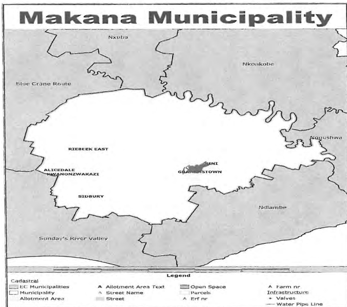
Figure 1. Physical location of Makana Municipality

The Makana Municipality employs about 586 employees. It also has 24 councillors from 12 community wards and 12 proportional representatives from different political parties. From these 24 councillors, six are elected to chair six different portfolio committees and six serve in the Environment, Disaster Management and Heritage portfolio within Makana Municipality.