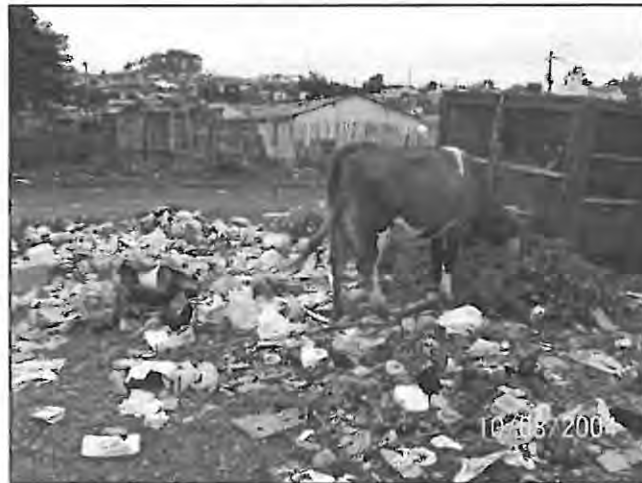
Figure 6: Stray livestock scavenging waste.

This article shows that stray animals have the potential to cause harm to humans through road accidents and spreading of disease from rubbish food in the bins. Figure 6 shows stray livestock spreading rubbish in and around a skip in Makana municipality.