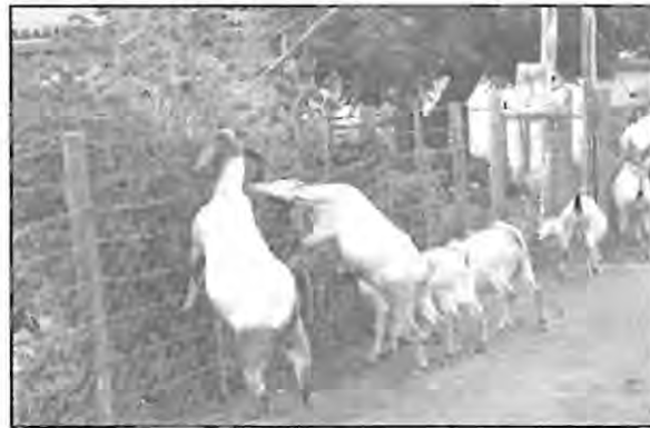
Figure 7: Stray goats browsing at a hedge

The overgrazing caused by a large number of stock has a potential impact on the soil as it leads to degradation of the soil. Figure 7 shows goats browsing at a hedge in Makana municipality.