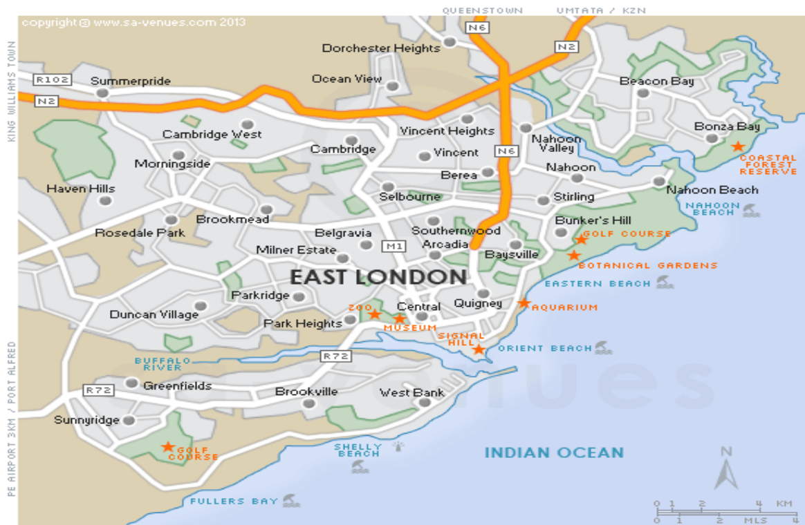
Map 4.1 – East London