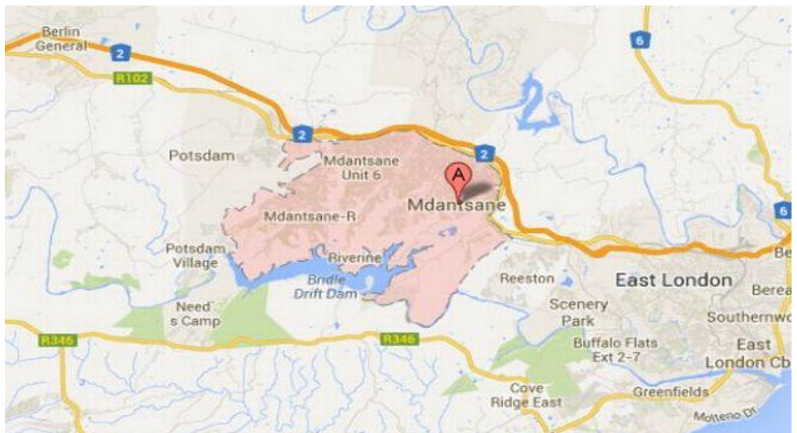
Map 4.2 – Mdantsane