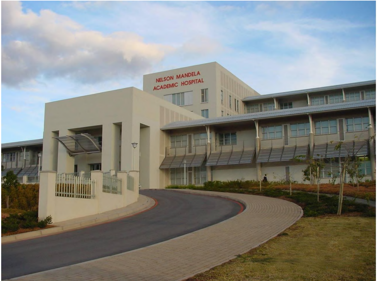
Figure 1: Nelson Mandela Academic Hospital